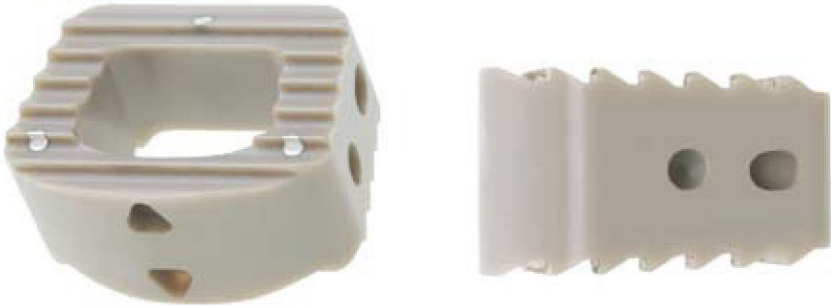
VERTE-STACK® BOOMERANG® II PEEK Vertebral Body Spacer