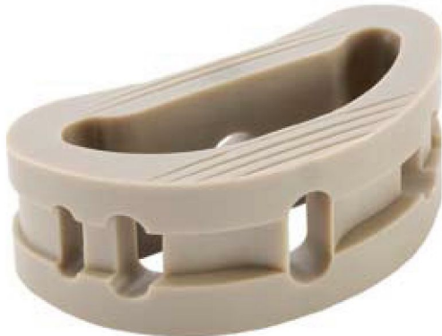
VERTE-STACK® BOOMERANG® PEEK Vertebral Body Spacer